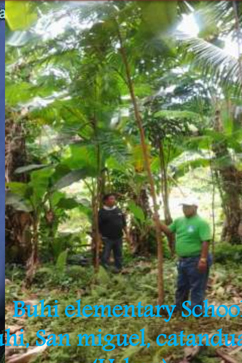
Buhi elementary School Buhi, San miguel, catanduanes (Urban)