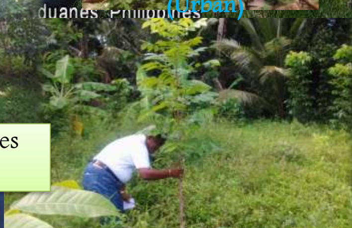
Pajo, San Isidro, Virac, catanduanes