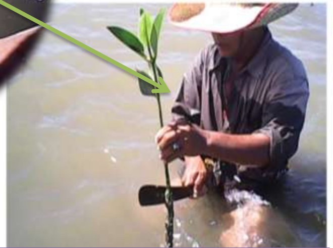
Removal of barnacles