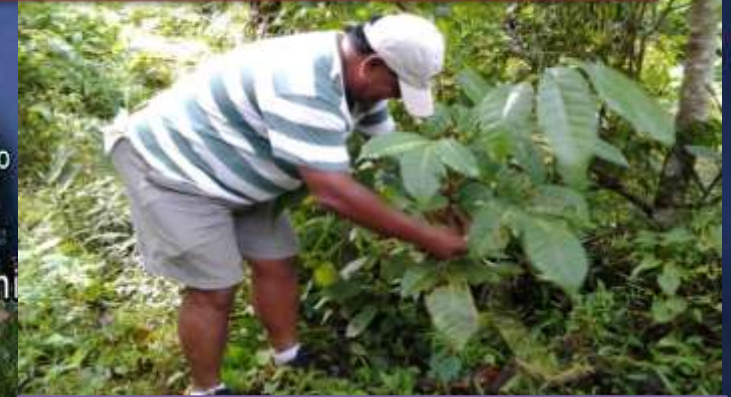
Tariwara, Pandan, Catanduanes (watershed)