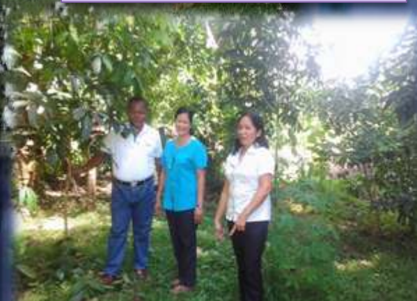
Palta, Virac, Catanduanes Urban