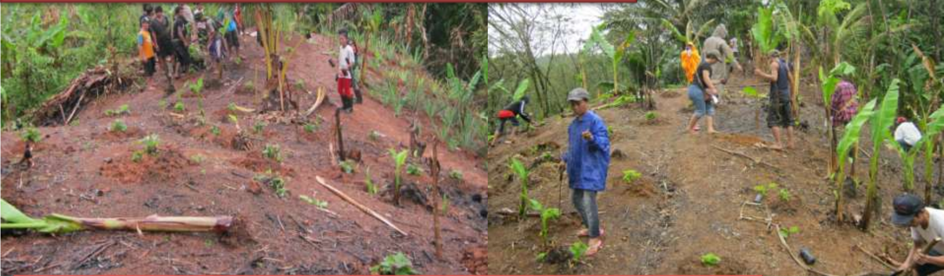
Progreso, San Miguel (5 ha) 2 years AFTER...