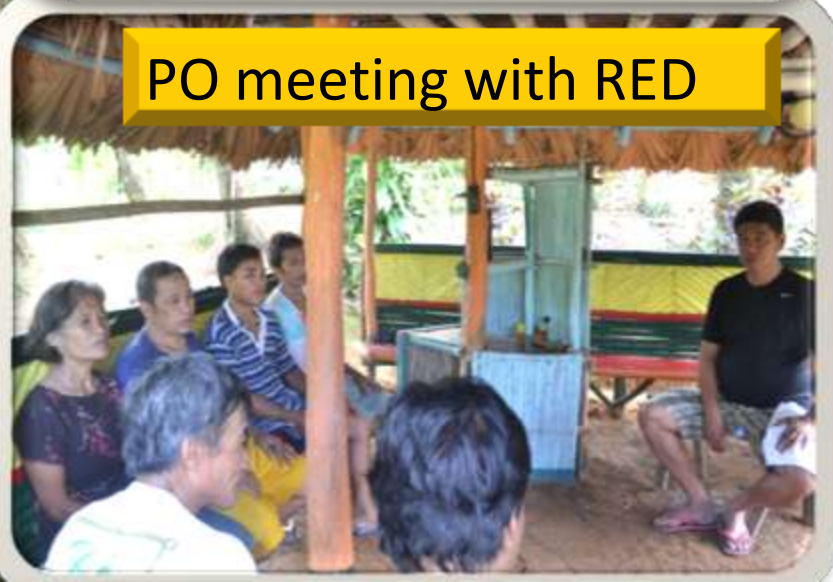
PO meeting with RED